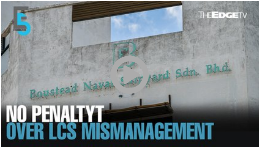
06 Sep 2022 | 09:00pm Featured, Eveni... EVENING 5: No penalty for BHIC over LCS mismanagement