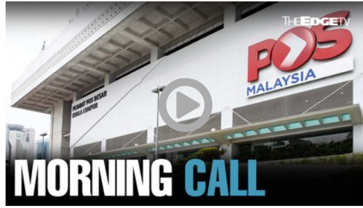
06 Sep 2022 | 06:30am Morning Call, F... MORNING CALL: 6/9/22