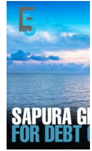
05 Sep 2022 | ... EVENING 5 with debt re